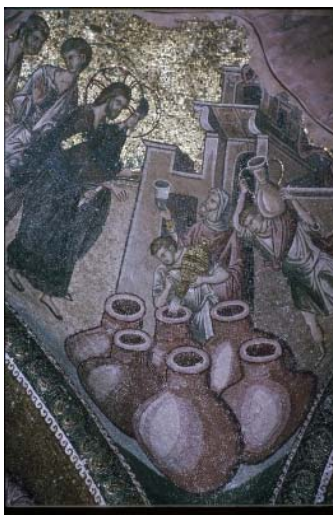
2. the Seven Miraculous Signs in John