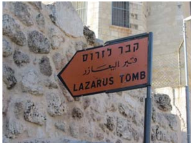
20. Jesus and the Feasts of the Jews 2; Lazarus (John 7-12)