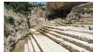
17. John 7-12