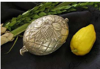
17. John 7-12