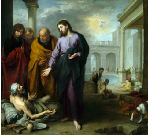
Bartolomé Esteban Murillo, Christ at the Pool of Bethesda

Anticipated by the Healing the Nobleman's Son in Cana: Jehovah creates, Jesus re-creates/heals