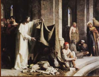
Carl Bloch, Healing at the Pool of Bethesda