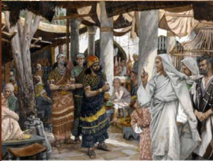
The healing of the son of a nobleman by James Tissot