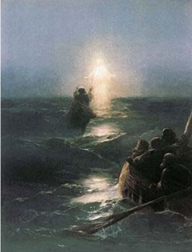
19. Jesus and the Feasts of the Jews 1 (John 5–6)